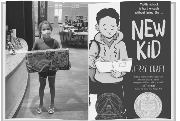
Congratulations to our grand prize winners!