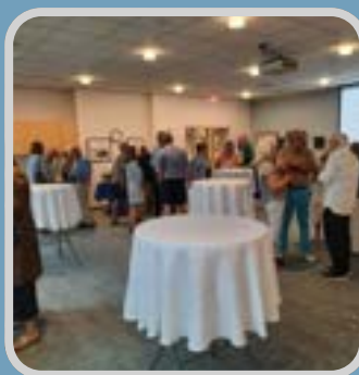
The Garden Club Katz event drew a large crowd.