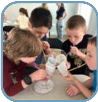
Children explored bubbles at the Summer Camp drop-off program.

June : The Beachside Bash celebrated summer with reggae tunes under the stars at the Surf Club.