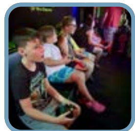
Teens play video games at the Summer @Scranton Block Party.