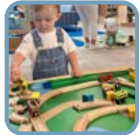
Friends love playing with trains in the Children's Room.