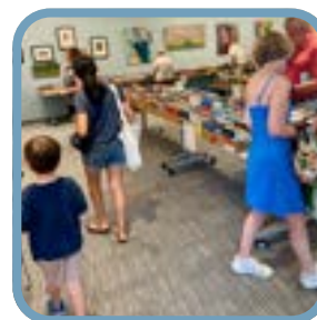
The Friends of Scranton Library hold 3 book sales a year.