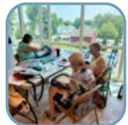
The Fiber Arts Club enjoys meeting in the Creative Loft.