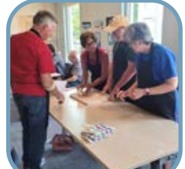
Adults learned about the art of pizza making.