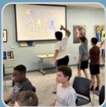
Teens having fun playing video games.

December: The library sponsored a Holiday Helper Hangout in the Children's Room so that parents could shop for holiday gifts while their kids were safely supervised.