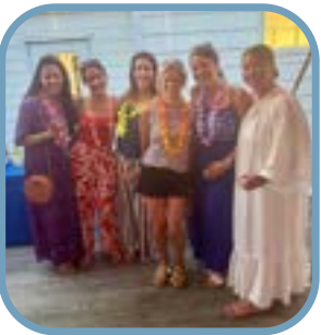
Adults had fun ringing in summertime at the Beachside Bash.

March : The library was packed with teenagers preparing for exams. We're proud that they enjoy using our study rooms, Teen Room, and library space.