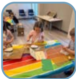
Children make fossils during the Summer Drop-Off Program.

July: The Summer Drop-Off Program began. This free program for Madison children is funded by a generous grant from the Schumann Family Foundation.