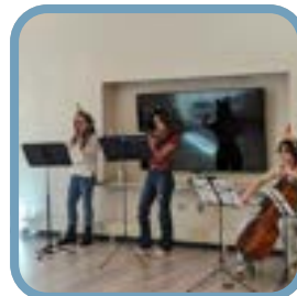
Giving Bach performs in the Children's Room.