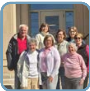
Friends group gathers at the Library steps.

You can help with sorting books throughout the year or assist at the book sales.