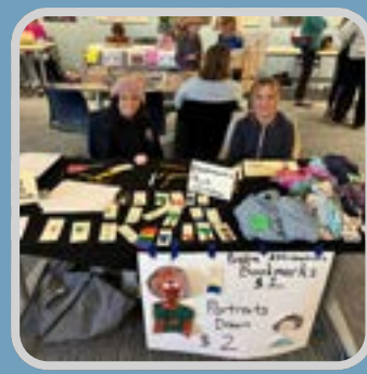
The youth entrepreneur market was a great success.