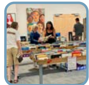
Book sales are a great way to meet new people and help the library.

To learn more about the Friends group and how to join, visit: https://scrantonlibraryfriends.wordpress.com/