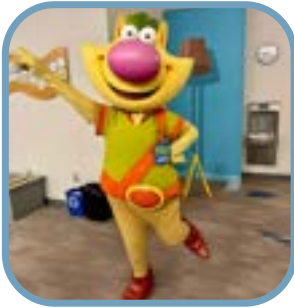
Nature Cat, a museum exhibit in the Children's Room, opened in February 2025.

January : Open Mic Night, a monthly program hosted by Madison's Poet Laureate, began. Patrons joined in to read poetry, sing, play an instrument, and more.